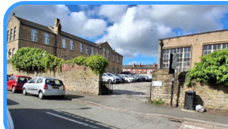
Entrance to car park from Vincent Road